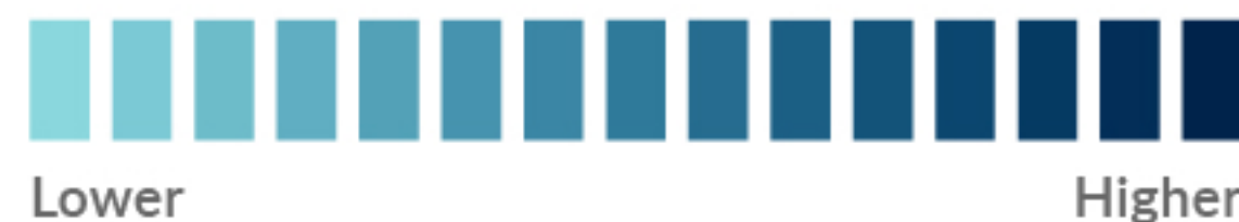
State Beer Excise Tax Rates (Dollars per Gallon)